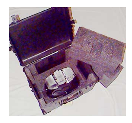
QUASAR Body Phantom Model QBDP-case